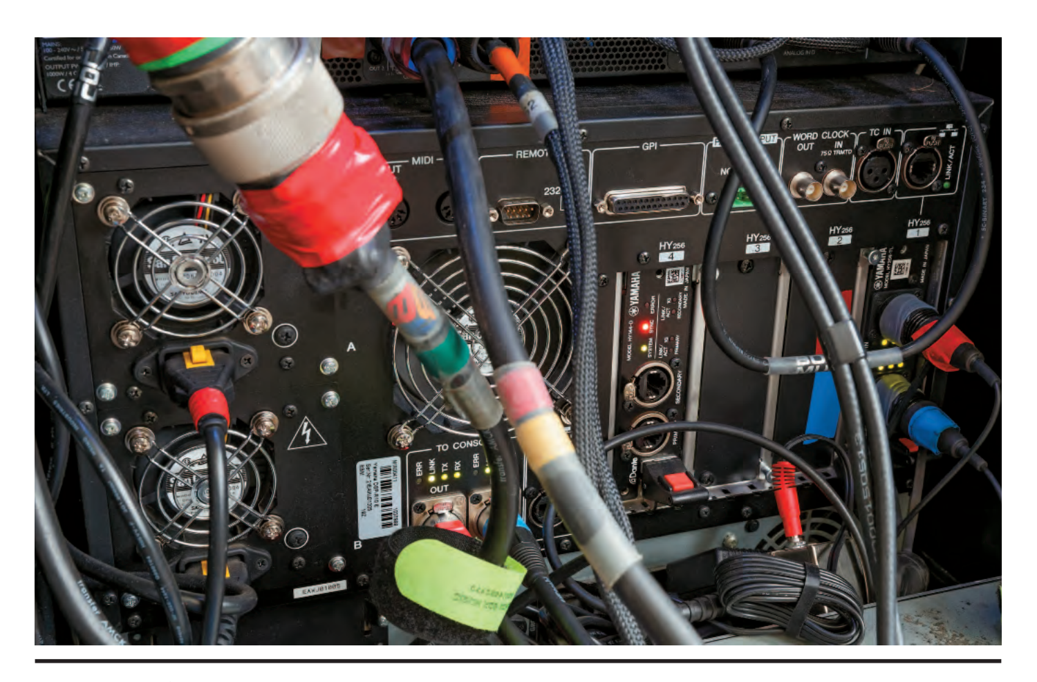
DSP-R10 DSP engine with redundant power supplies