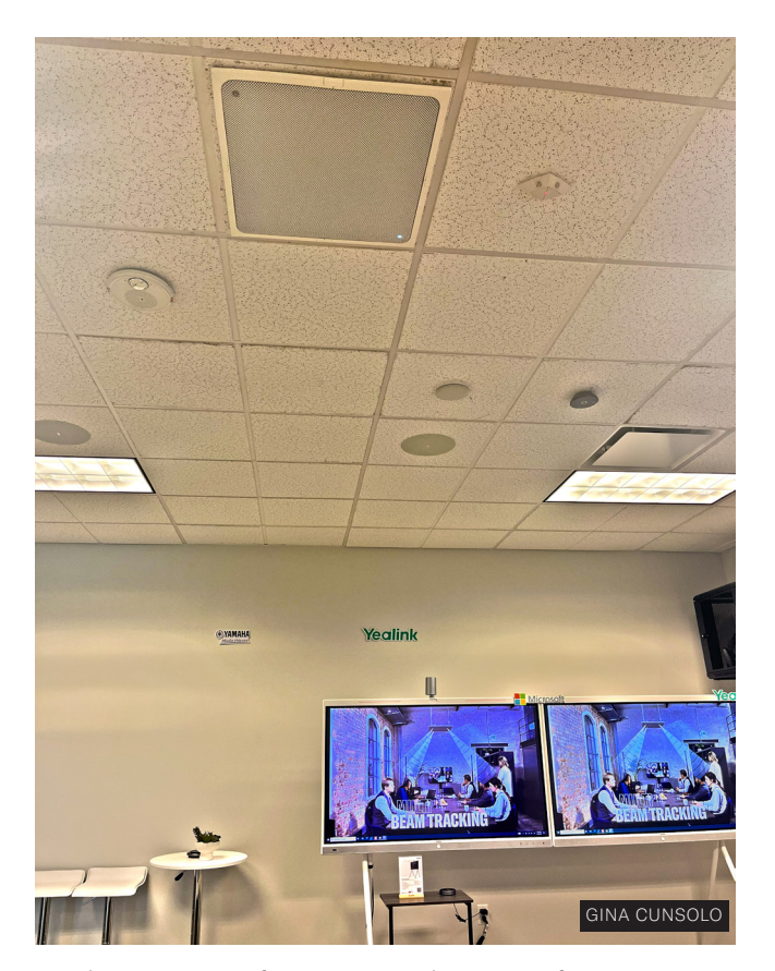
tracking system for Zoom and Microsoft Teams meetings. The joint solution not only enables presenter tracking and speaker tracking, but

also includes technologies like adaptive echo canceling, automatic gain control, noise reduction and dereverberation, to give remote attendees an immersive video and audio experience.